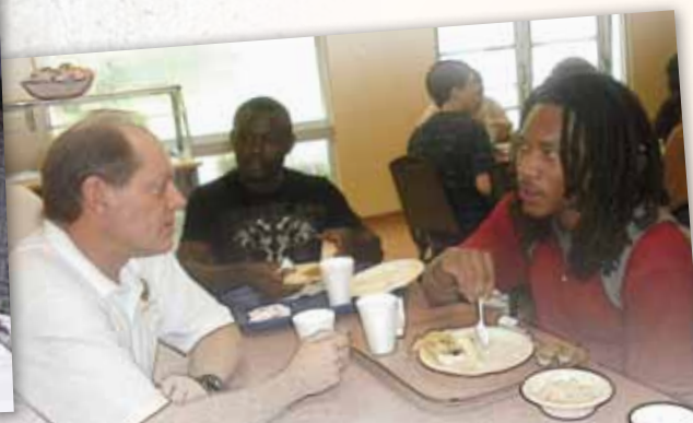
LEFT: Mom and daughter enjoying Thanksgiving meal